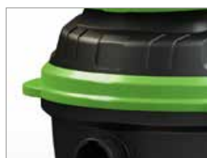
SIDE PROTECTION AGAINST DOORS AND WALLS