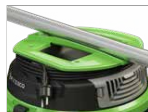
ERGONOMIC HANDLE WITH INTEGRATED CABLE WRAP