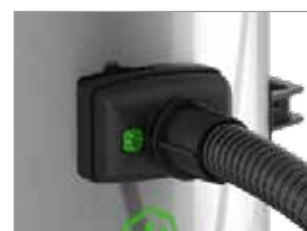
FLEXIBLE HOSE IS LOCKED SECURELY AND RELIABLY