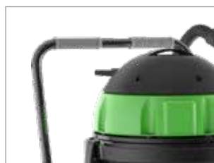
TROLLEY WITH HANDLE