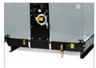
EASILY MOVED WITH A FORKLIFT TRAILER MOUNTING CAPABILITY