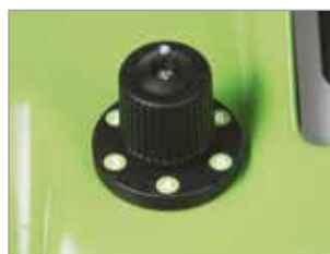
ROTARY KNOB FOR STEAM FLOW RATE CONTROLLER