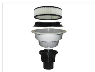
SYSTEM DFS FOR SIMULTANEOUS DRY AND WET PICK UP