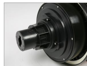
HEAD WITH ANTI FOAM SYSTEM