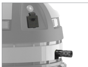
SOCKET FOR POWER TOOL (TC) AND/OR PNEUMATIC TOOL (PN) WITH AUTOMATIC START/STOP