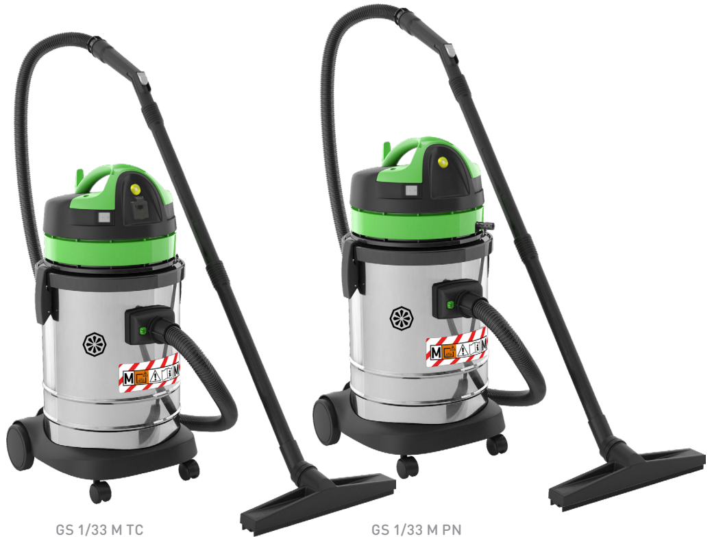
GS 1/33 M TC