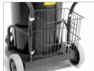
OPTIONAL TOOL HOLDER