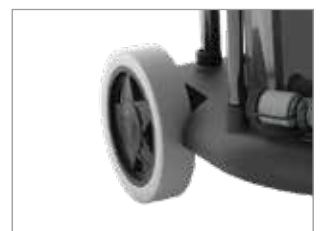
LARGE REAR WHEELS WITH TYRES