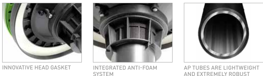
INNOVATIVE HEAD GASKET