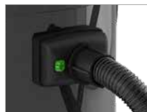
FLEXIBLE HOSE IS LOCKED SECURELY AND RELIABLY