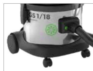
TROLLEY WITH 2 FRONT SWIVELLING WHEELS AND 2 LARGE REAR WHEELS