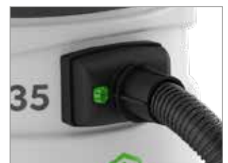
FLEXIBLE HOSE IS LOCKED SECURELY AND RELIABLY