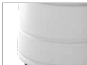
ULTRA-SHOCKPROOF PLASTIC TANK