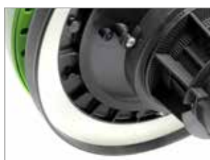
INNOVATIVE HEAD GASKET