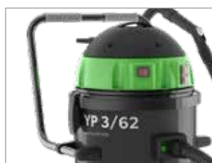
TROLLEY WITH HANDLE