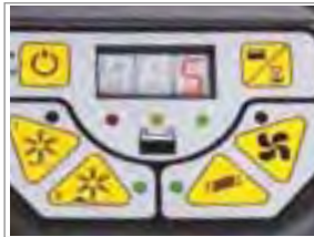
INTUITIVE CONTROL PANEL