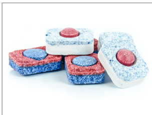
REMOVES SOAP STAINS