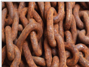
CAN REMOVE RUST