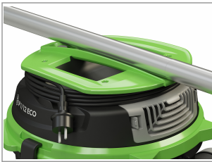
ERGONOMIC HANDLE WITH INTEGRATED CORD WRAP