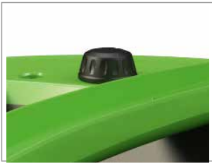
SPEED AND NOISE REGULATOR